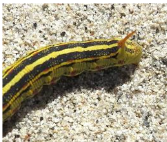
White-Lined Sphinx moth Caterpillar