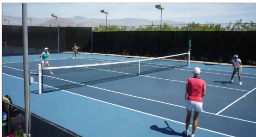
During the Powerful Primroses finals on March 17, 2013