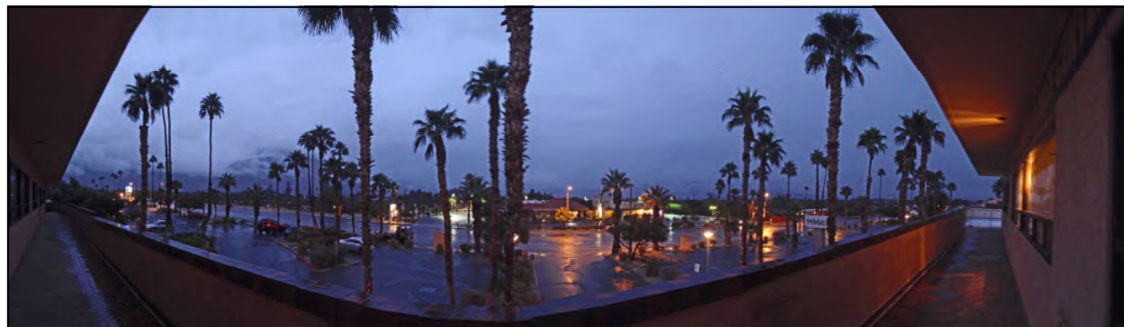
Rain falling in downtown Borrego Springs December 13, 2012