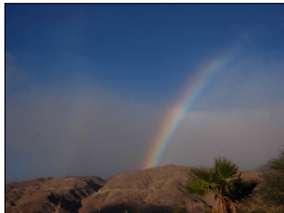
Double rainbow on November 26th